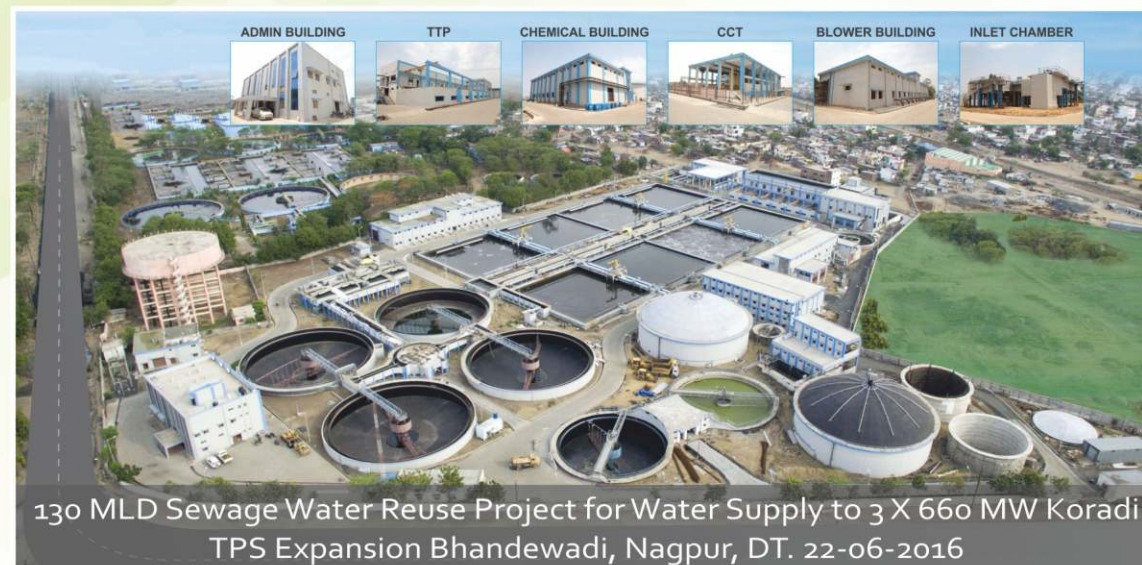
130 MLD Sewage Water Reuse Project for Water Supply to 3 X 660 MW Koradi TPS Expansion Bhandewadi, Nagpur, DT. 22-06-2016