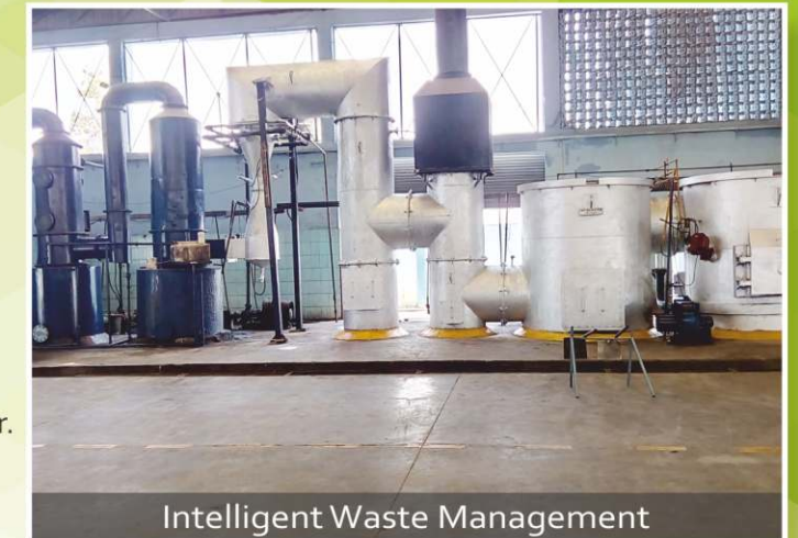
Intelligent Waste Management

Common BMW Facility at Ranchi Recognition: The Mumbai's BMW facility is the biggest CBWTF in Asia.