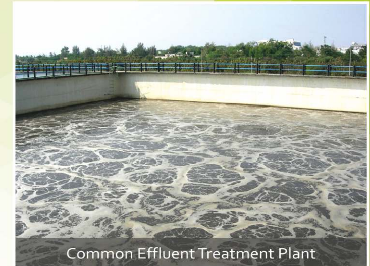
Common Effluent Treatment Plant

Capacity Enhancement of CETP Nagpur from 5 MLD to 10 MLD and CETP Amravati from 5 MLD to 10 MLD.