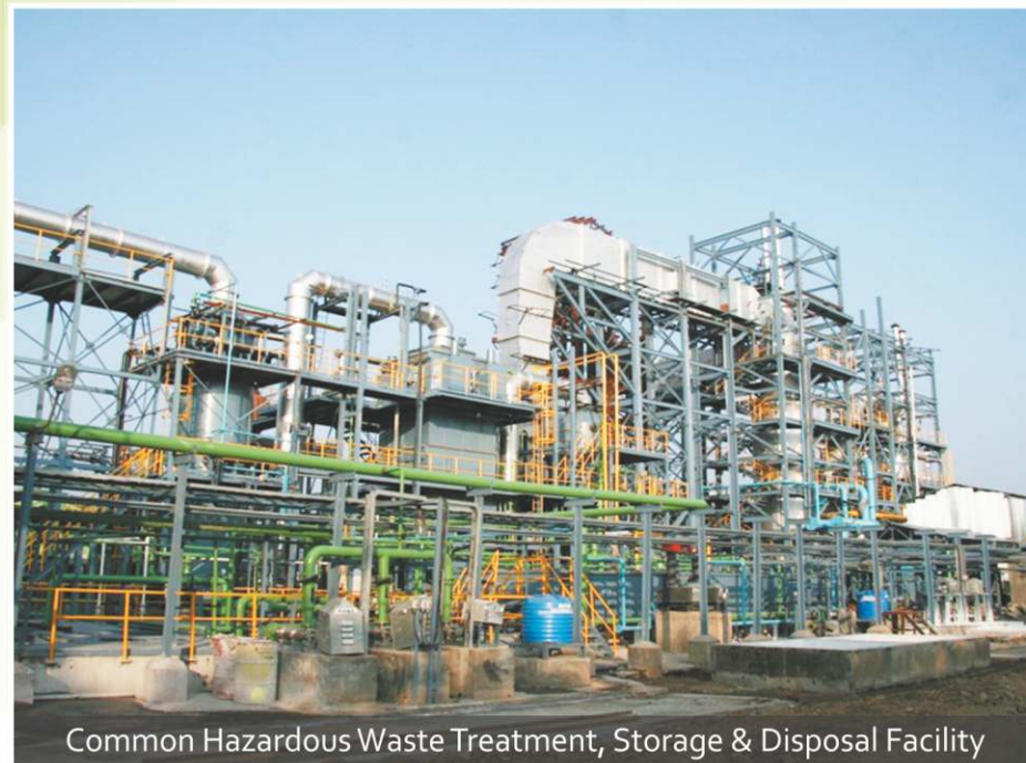
Common Hazardous Waste Treatment, Storage & Disposal Facility