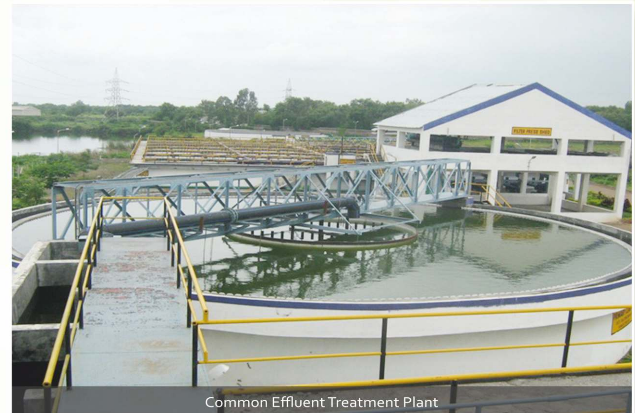
Common Effluent Treatment Plant